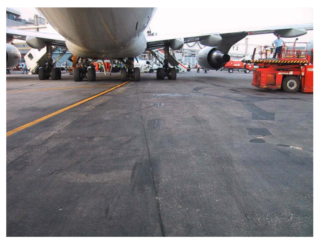
Ground marks the day of the incident (intermittent and strongly marked)