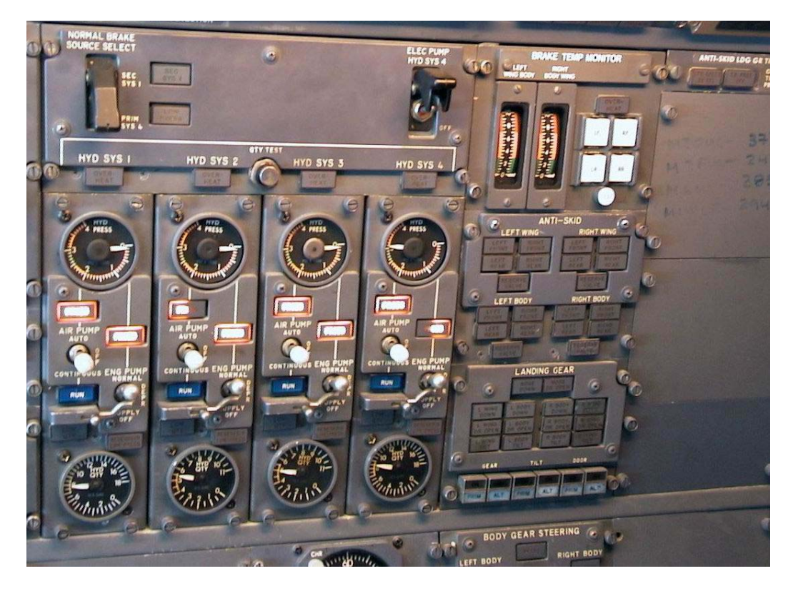
CM-3 Panel. ACP switch (labeled "ELEC PUMP HYD SYS 4", cover lifted) noted. Pressure gauge of Hyd. System No. 4 shows 3100 PSI.