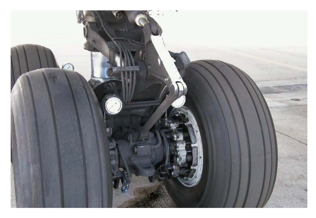
Gauges installed on the brakes of TF-ATH