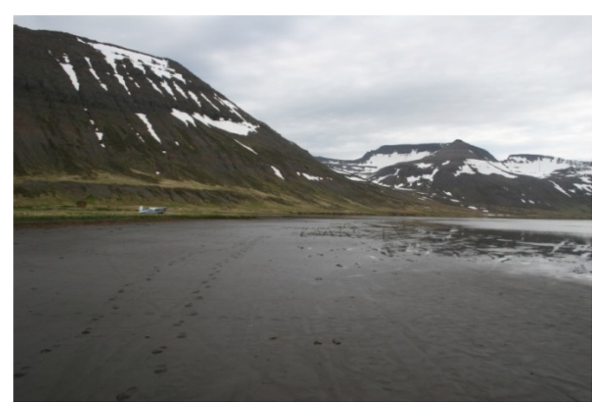
Figure 1: Landing area in Fljot

During the descent from 2,000 feet the pilot applied partial carburetor heat momentarily. The pilot slowed the aircraft down and then continued the descent towards the landing area. Approaching final toward the east the pilot decided to practice a touch-and-go landing before making the final landing. There was a slight crosswind (see Figure 2) from the right and the pilot approximated that he flew the aircraft with a 10-20 degree bank towards the right wing and 40 degree flaps.