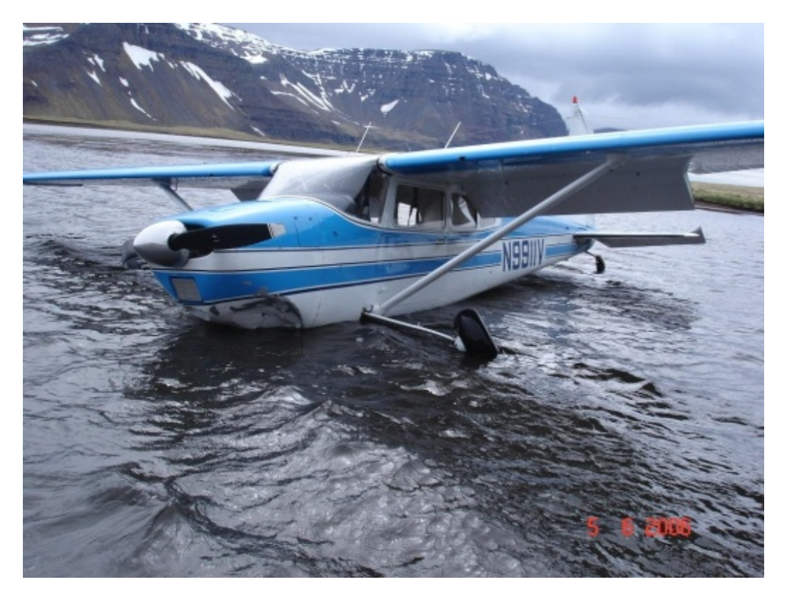
Figure 3: Aircraft at accident site

The aircraft touched down hard on the main landing gears in the knee-deep water beyond the landing area (see figure 3 above). The pilot secured the aircraft by switching off the master switch, turning the magnetos off, and putting the fuel selector valve to the off position. The pilot was not injured and left the aircraft unassisted.