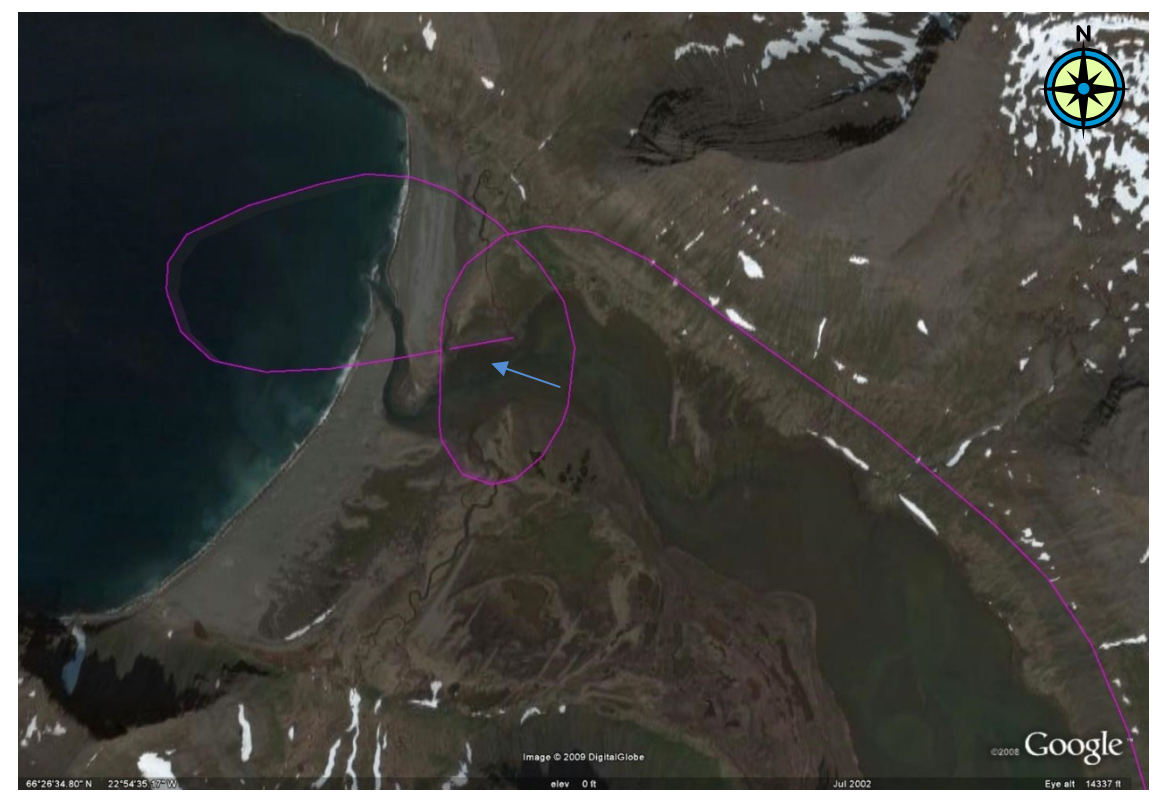
Figure 2: GPS track and reported wind direction shown by blue arrow

According to the pilot the touchdown was normal and after approximately 30-40 meters (98-131 feet) he applied power again. Just after rotation and initial climb the engine rpm suddenly dropped. The engine started sputtering and sounded like it was going to stop. The pilot removed power by throttling back in an attempt to keep the engine running. The pilot's attempts were not successful and the engine stopped running.