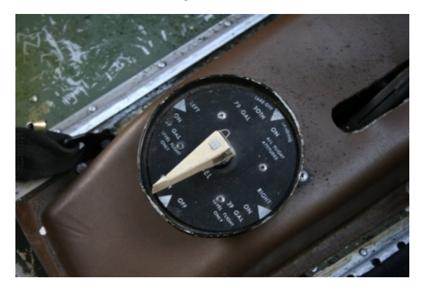
Figure 4: Fuel selector valve

The fuel selector valve in the aircraft is shown in Figure 4. According to the pilot he placed the fuel selector valve to the "RIGHT ON" position when departing Isafjordur and it remained in that position until after the accident. When the AAIB arrived on scene the fuel selector valve had been set, by the pilot, to the "OFF" position. The homemade checklist the pilot was using did not contain an item for selecting "BOTH ON" before landing.